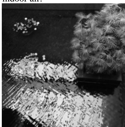
Fig.2 Display of Ethnic Elements

The use of national cultural elements in environmental art design can be created by means of a variety of technical means and expression techniques. Different environmental art design activities will present different artistic styles. Therefore, environmental art design works are the organic unity of designer's knowledge, ability, emotion, living comprehension, literary literacy and other aspects. Environmental art design needs to adapt to the cultural background, the spirit of the times and people's spiritual and cultural needs. National culture has a profound cultural heritage, and there are many kinds of national culture in our country [5]. The combination of national cultural materials into environmental art design can effectively improve the artistry and quality of design. The combination of environmental art design and national cultural elements requires the help of new building materials and new design concepts, and the help of rich ways of expression to integrate the colorful national cultural elements, so as to promote the progress and development of environmental art design. For example, in the construction and design of Bashu area, bamboo poles are often used as building materials. In the construction of garden landscape, bamboo landscape gradually becomes a representative architectural landscape [6]. In the interior architecture, bamboo can enrich the color matching and purify the indoor air.