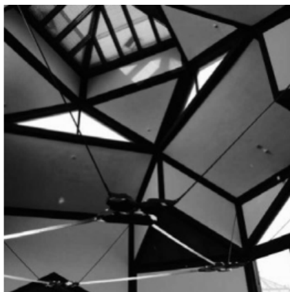
Fig.1 The Display of Ethnic Elements in Suzhou Museum